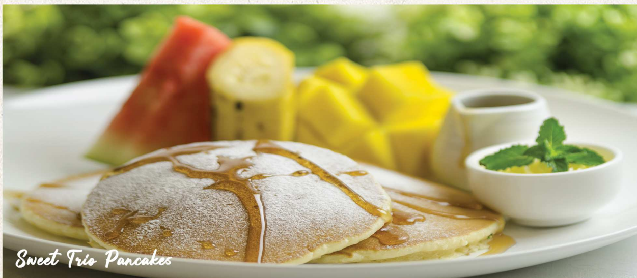
Sweet Trio Pancakes