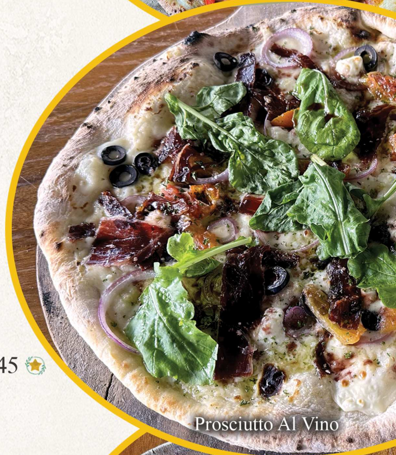
Prosciutto Al Vino