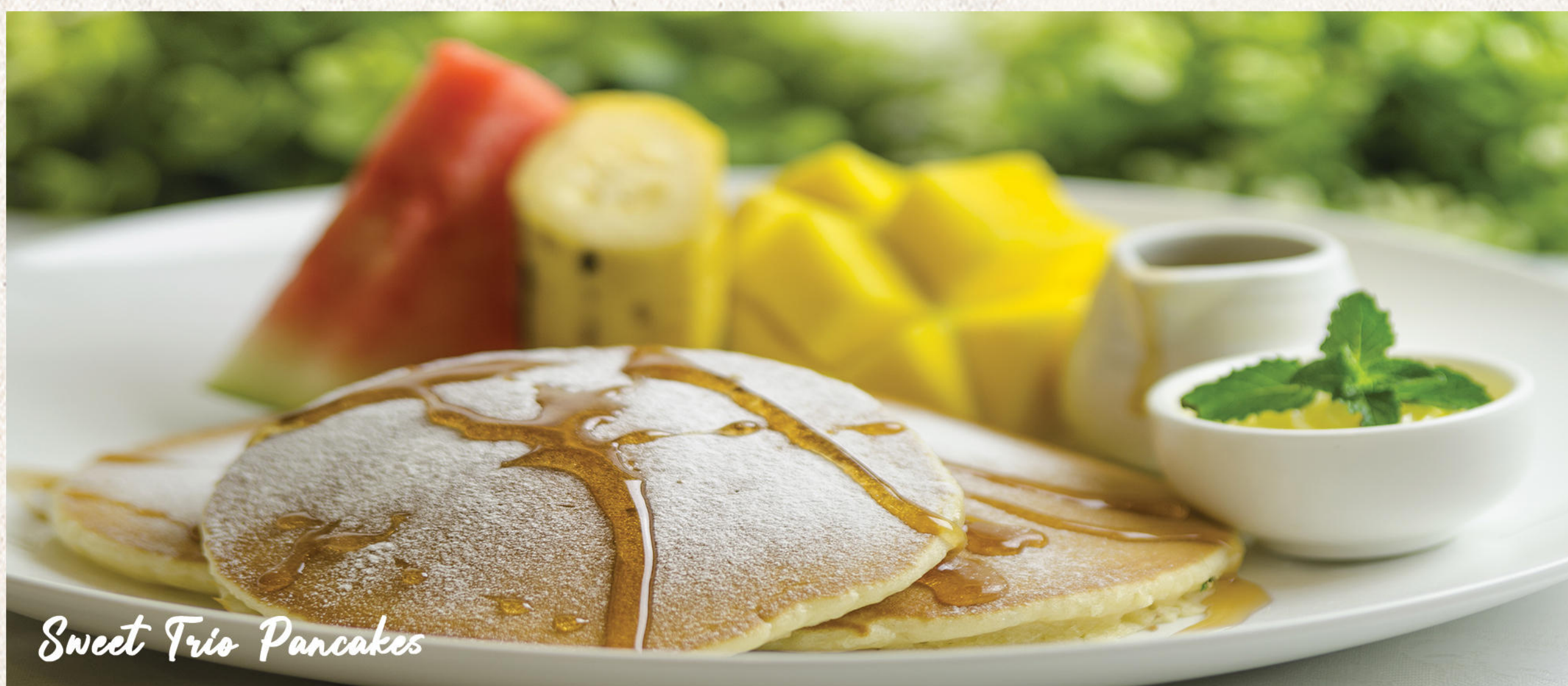
Sweet Trio Pancakes