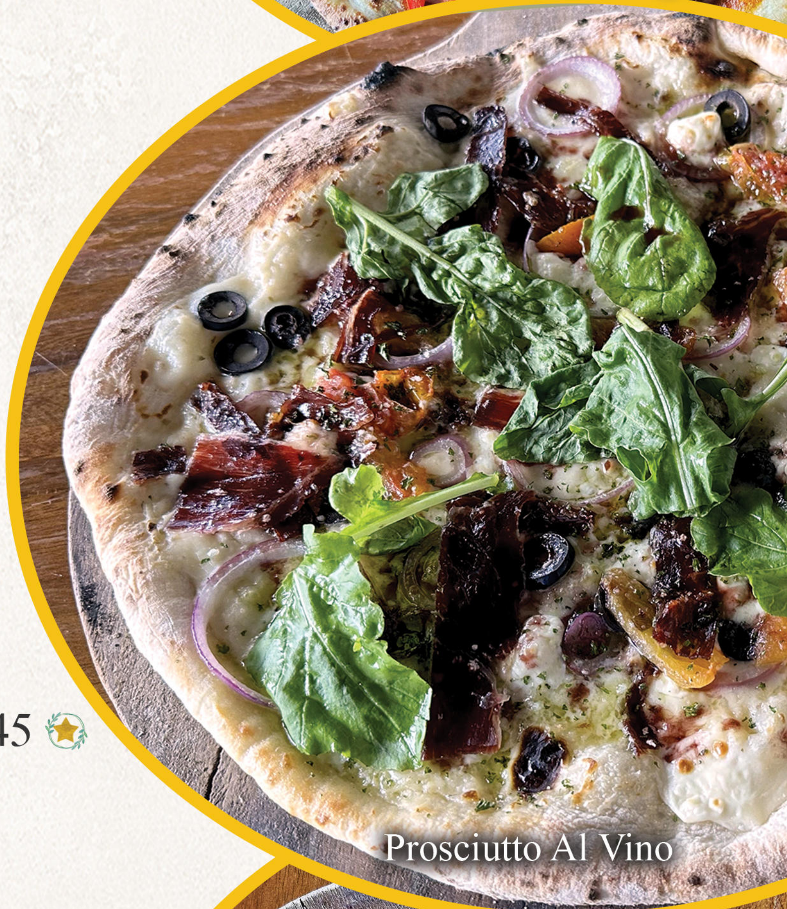
Prosciutto Al Vino