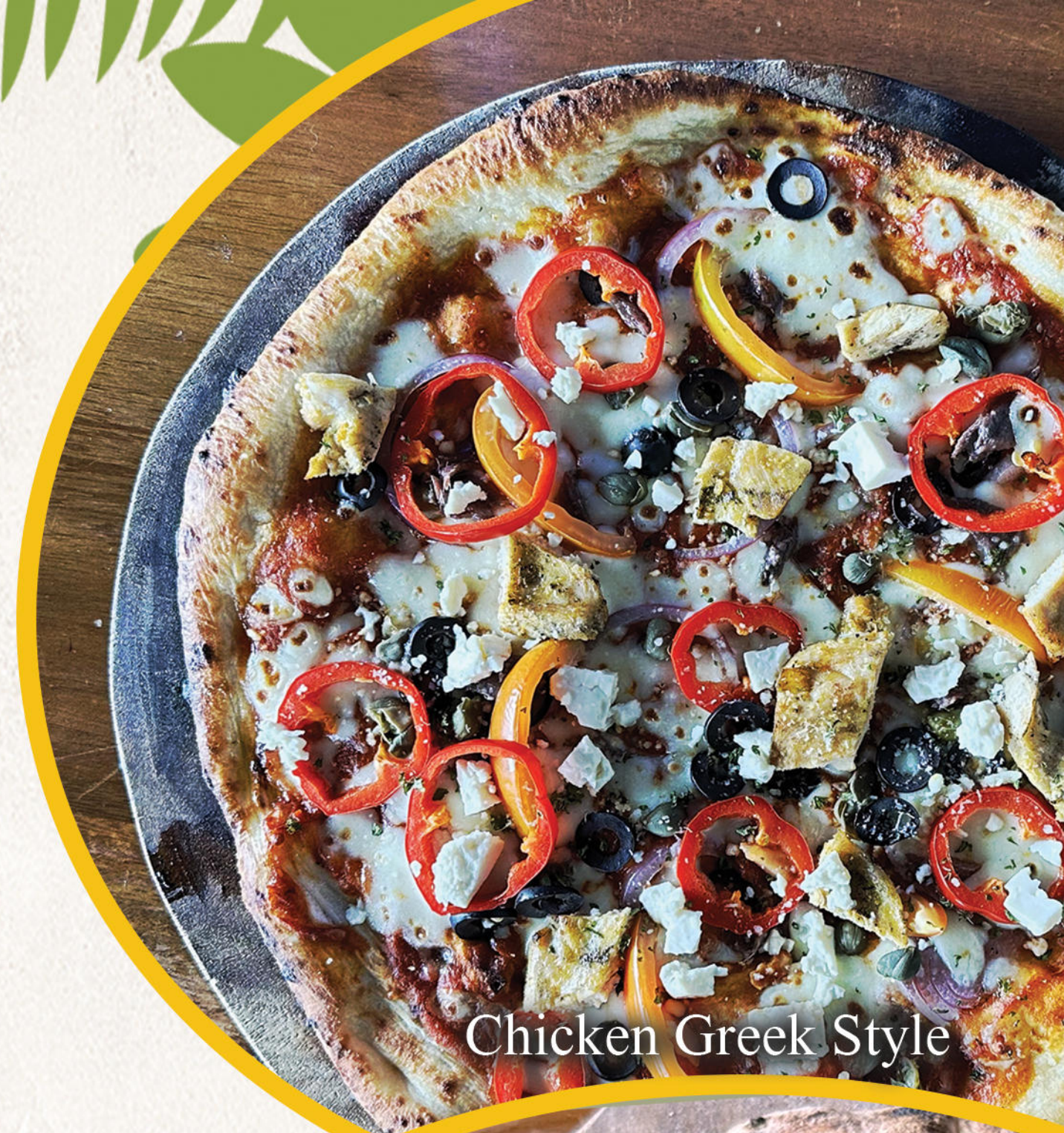
Chicken Greek Style

Neapolitana pizza topped with cheese fondue, mixed cheese, smoked salmon, arugula, bell peppers, tomato, capers and whipped cream cheese.